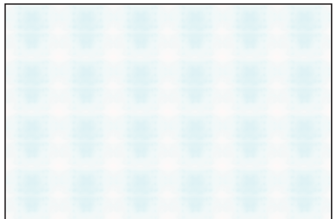
Uncorrected panels show a regular patterning of cyan colour shift, corresponding to the hotter parts of the screen.

The amount of correction can be adjusted dynamically, even during a show, to account for changes in temperature over time.