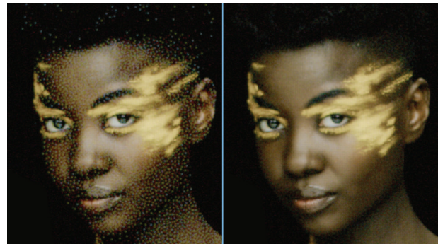
Performance at 1% brightness: Camera footage of 2000 Nits panels running at just 20 Nits.